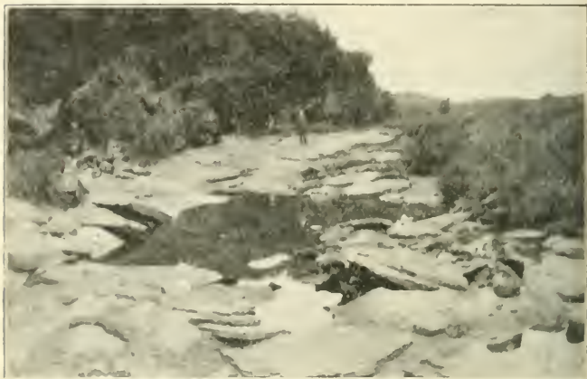
THE HAUNT OF KA KMA KHARAI.

When it was discovered that she was with child, she fled from her home, fearing the wrath of her father, and put herself under the protection of her maternal uncle, who lived in the Pomdoloï cave, and was one of the famous dragons, or Yak Jakors of the country.